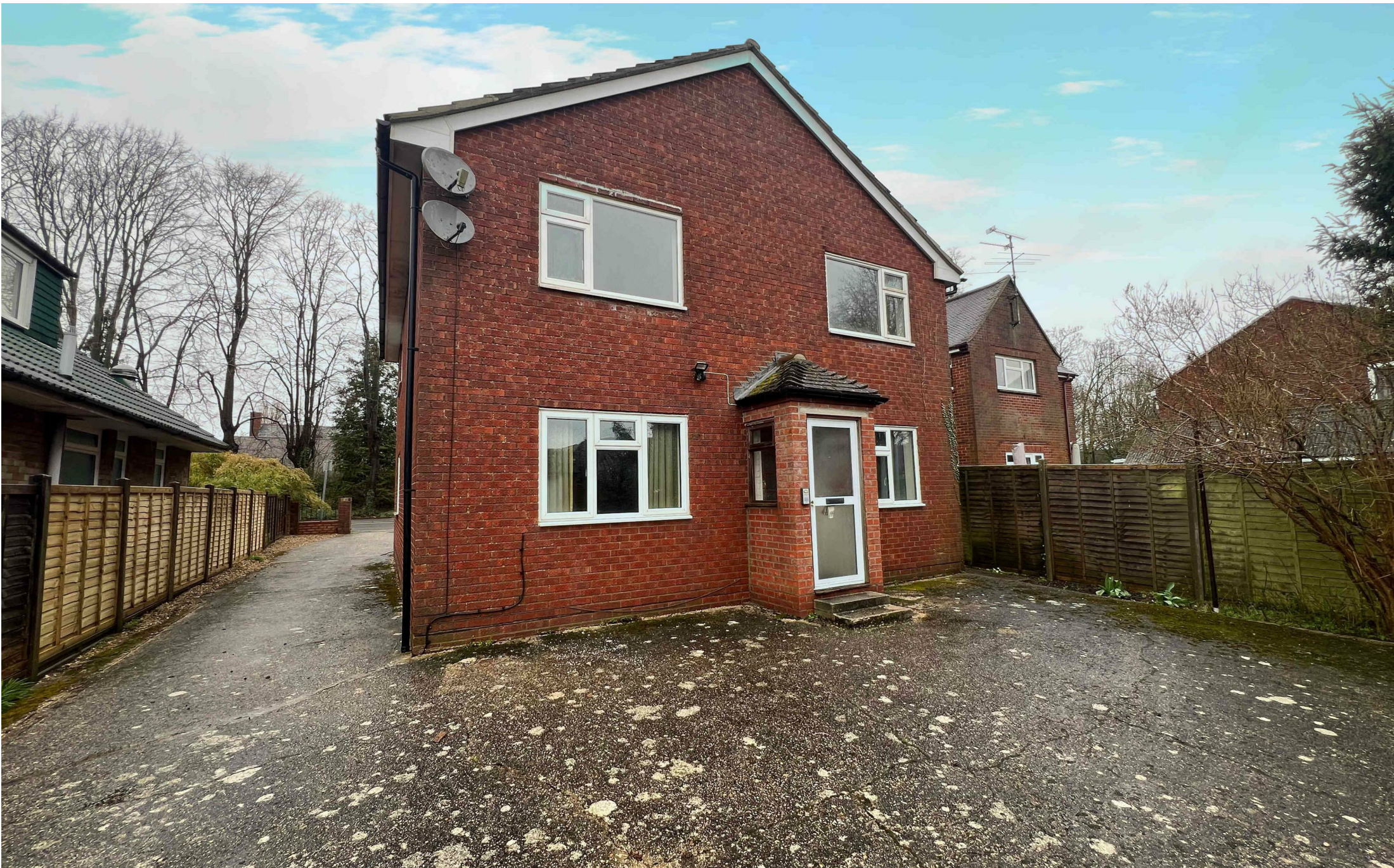
Darlington Road, South View, Basingstoke, RG21 5NY